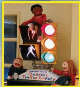
The Children's Safety Village of Windsor and Essex County offers a variety of safety programs throughout the year.