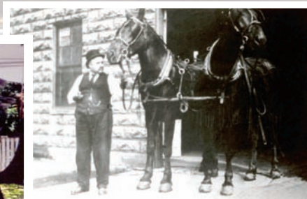
The 1904 Horse and Buggy