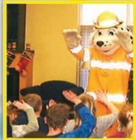
The fire program is offered to Grades One, Three and Five.