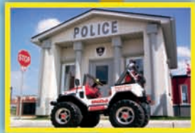
The Police Program is offered to Senior Kindergarten and Grades Two and Four.